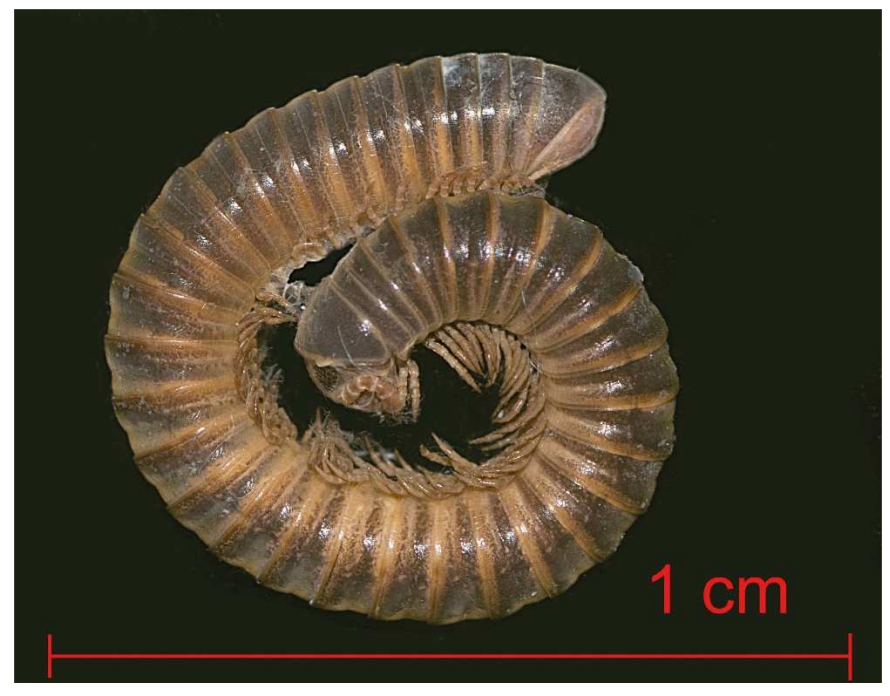
Figure 3: A female of Eucarlia hoffmani.